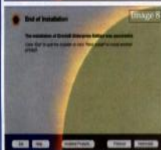
Image 08: Click here Ok and go for next. After that display the screen as just now finished oracle server installation successfully.

Second stage : After finish of Oracle installation : (Image 09 , Image 10 & Image 11)